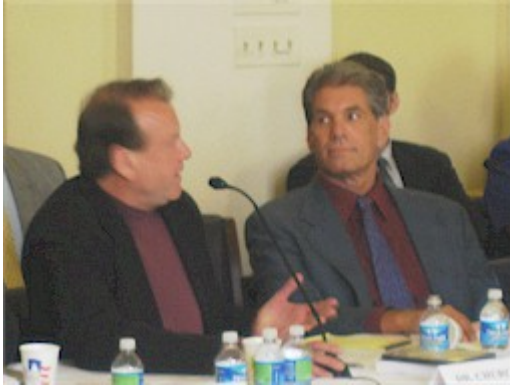
Dawson's Poignant Testimony