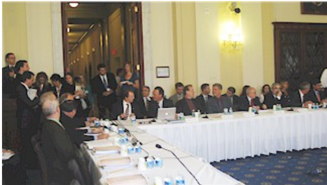
The Hearing about to begin