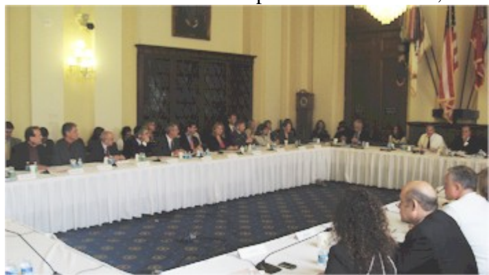
The Meeting Being Called to Order